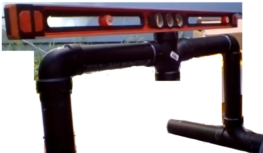
Fig 2. Installation of the apparatus feet.